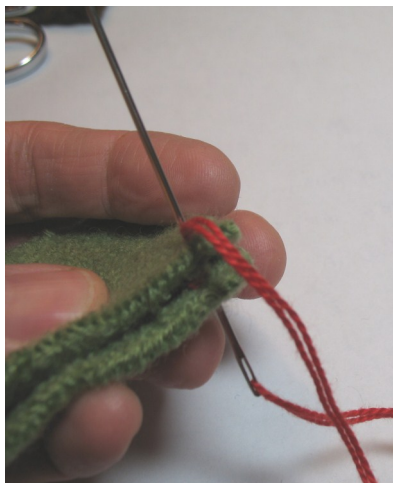
Step 2: Bring needle to bottom and go back through to the top in same spot as 1st stitch