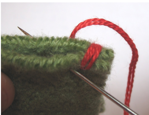
Step 4: Insert needle directly below last stitch and bring the needle through the top 1/4" from 1st stitch